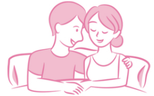
The age at which an individual has sex for the first time is influenced by genetics.